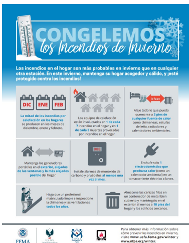
Put a Freeze on Winter Fires flyer Spanish