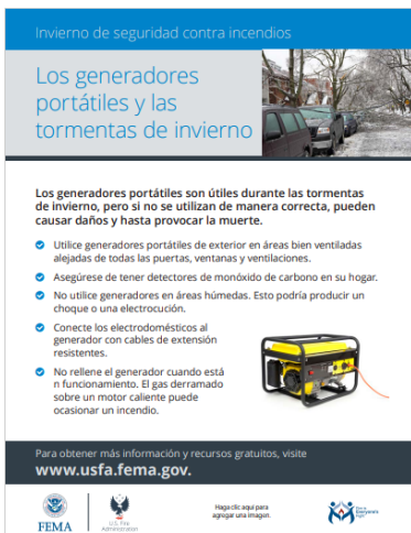
Portable Generators and Winter Storm flyer Spanish