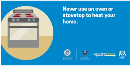
Never Use Your Oven Or Stove For Heat gif in English