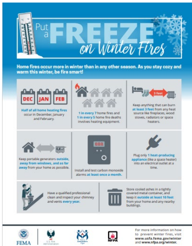
Put a Freeze on Winter Fires flyer English