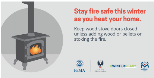
Wood Stove Stay Fire Safe This Winter gif English