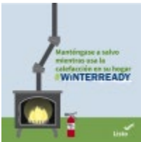
Stay Safe When Heating Your Home (Spanish)(Square) Download Graphic