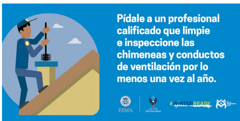
Have Chimneys And Vents Inspected gif Spanish