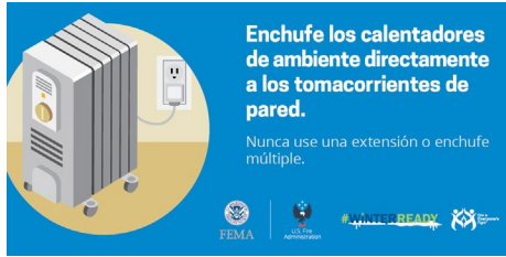
Plug Space Heaters into Wall Outlets English