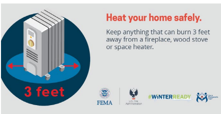
Heat Your Home Safely English