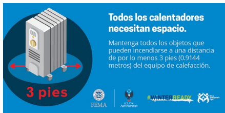
All Heaters Need Space Spanish