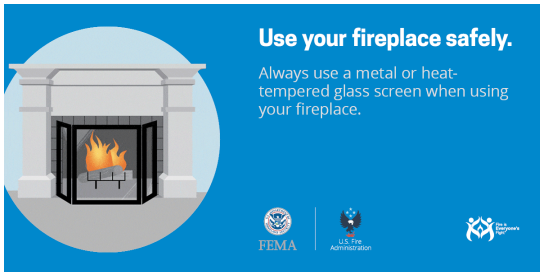
Use Your Fireplace Safely gif English