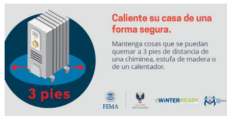
Heat Your Home Safely Spanish