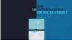
Un-Prepared Download Graphic