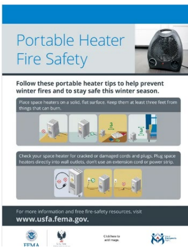
Portable Heater Safety flyer English