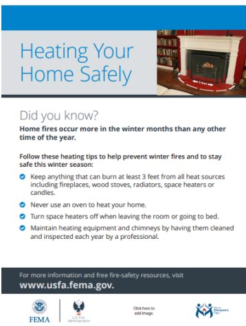
Home Heating Safety flyer English