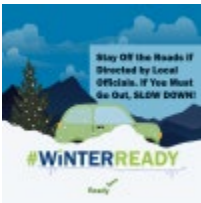
Stay off the Road (Square) Download Graphic