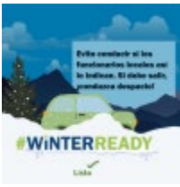
Stay off the Road (Spanish)(Square) Download Graphic