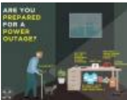
Prepare for Power Outage Download Graphic