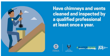
Have Chimneys And Vents Inspected gif English