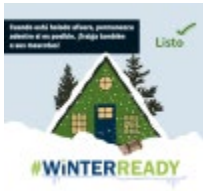
Stay Inside When It's Freezing (Spanish)(Square) Download Graphic