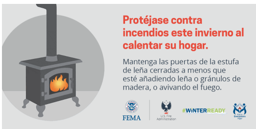
Wood Stove Stay Fire Safe This Winter gif Spanish .