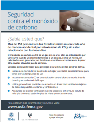
Carbon Monoxide Safety flyer Spanish