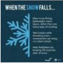
When the Snow Falls Download Graphic