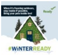
Stay Inside When It's Freezing (Square) Download Graphic