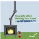
Stay Safe When Heating Your Home (Square) Download Graphic