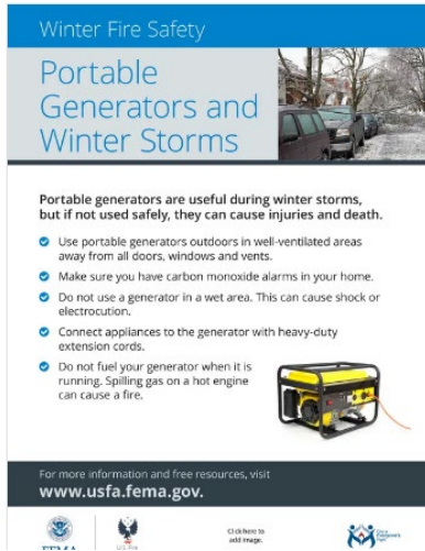
Portable Generators and Winter Storm flyer English