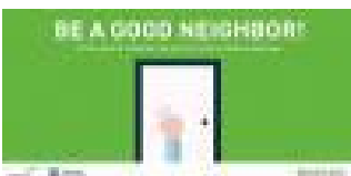
Be a Good Neighbor! Download Graphic