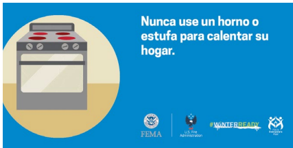
Never Use Your Oven Or Stove For Heat gif Spanish .