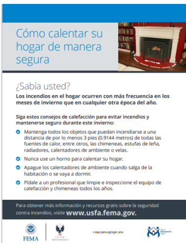
Home Heating Safety flyer Spanish