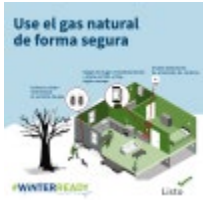
Use Natural Gas Safety (Spanish)(Square) Download Graphic