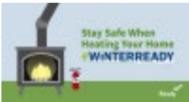
Stay Safe When Heating Your Home (Facebook and Twitter) Download Graphic