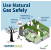
Use Natural Gas Safely (Square) Download Graphic