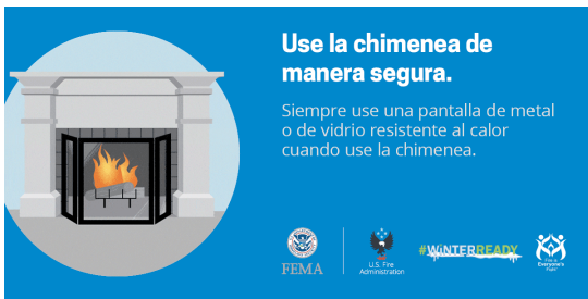
Use Your Fireplace Safely gif Spanish .