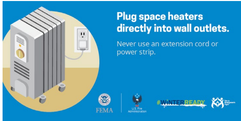
Plug Space Heaters into Wall Outlets Spanish